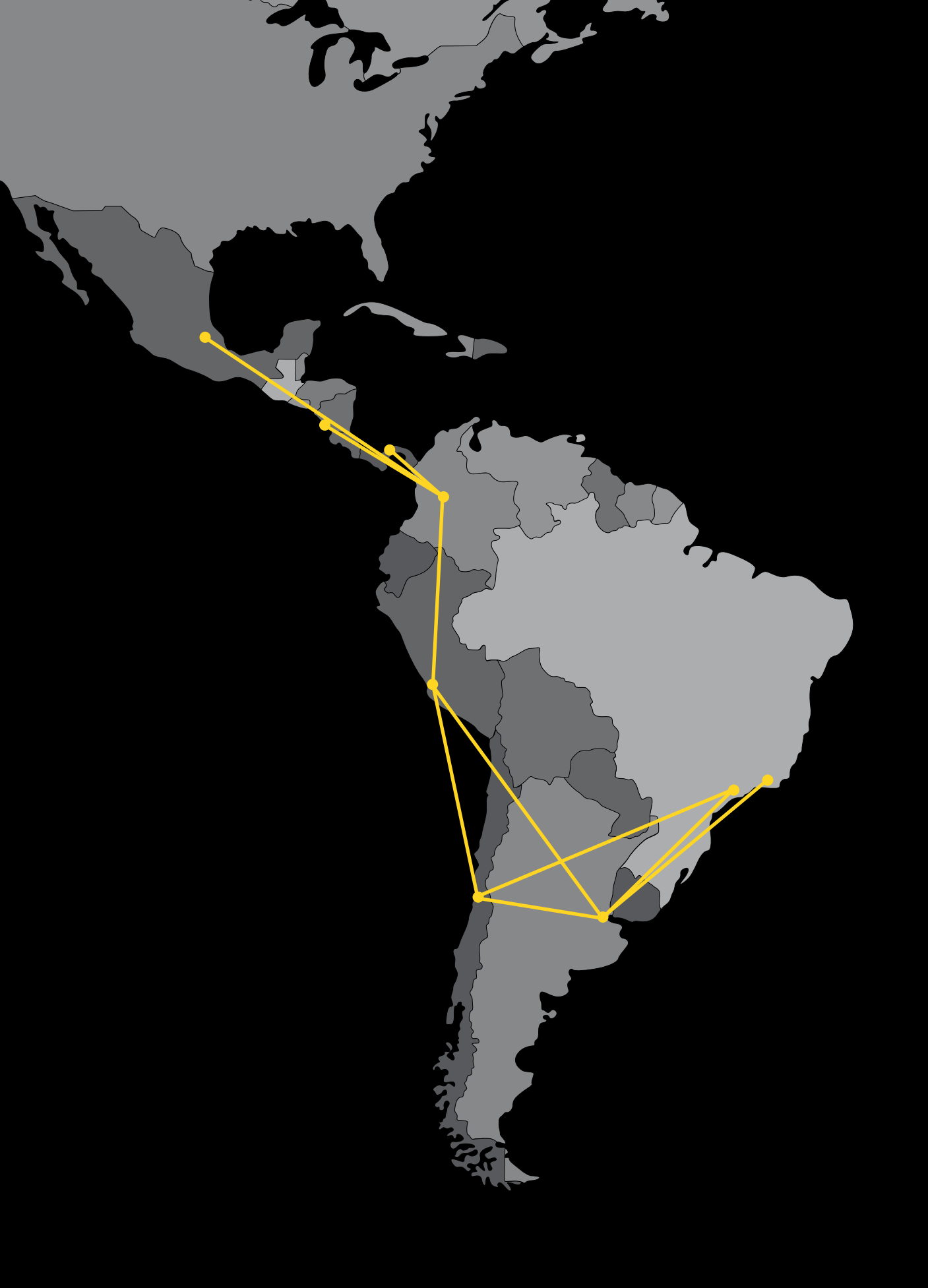
Top 10 Latin America Busiest International Routes