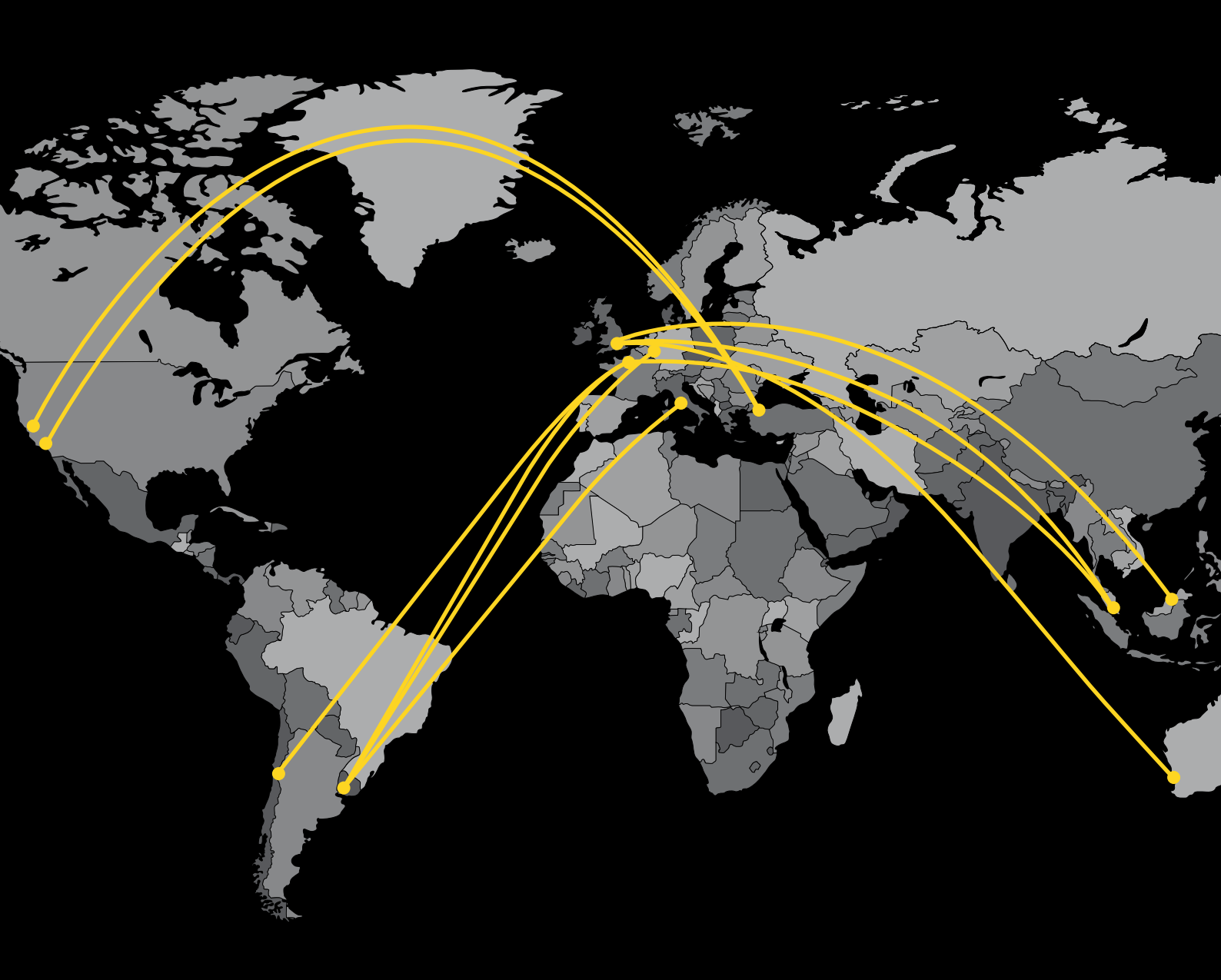
Top 10 Europe Longest International Routes